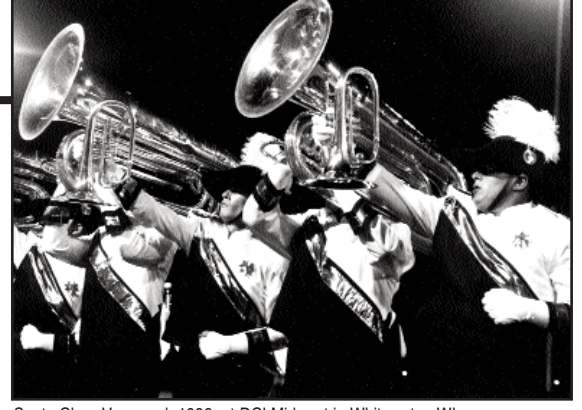
Santa Clara Vanguard, 1996, at DCI Midwest in Whitewater, WI.

The 1998 season saw a second-place finish and a high drum award at DCI Finals. The