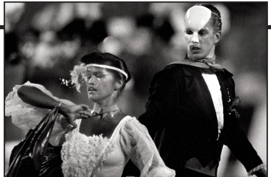
Santa Clara Vanguard, 1989, at DCI Midwest in Whitewater, WI (photo by Art Luebke from the collection of Drum Corps World).

Festive Overture, Pictures at an Exhibition Vanguard changed their show direction in 1986. The total theatrical