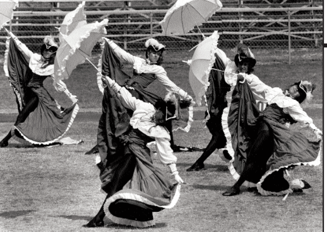
Santa Clara Vanguard, 1983, at DCI Midwest in Whitewater, WI.

competition. The only corps to beat Santa Clara that year was the Troopers -- once. After two days of DCI Prelims, 14,000 fans in Warhawk Stadium sat in tense silence waiting for scores. "And in second place, with a score of 86.15... the Troopers." The stands erupted into such a deafening roar, the announcer's voice could barely be heard. "And in first place, with a score of 88.65, the new DCI champions, the Santa Clara Vanguard!" The corps had won 27 contests that year, including the big one. The drum line went undefeated, something they repeated for two consecutive years.