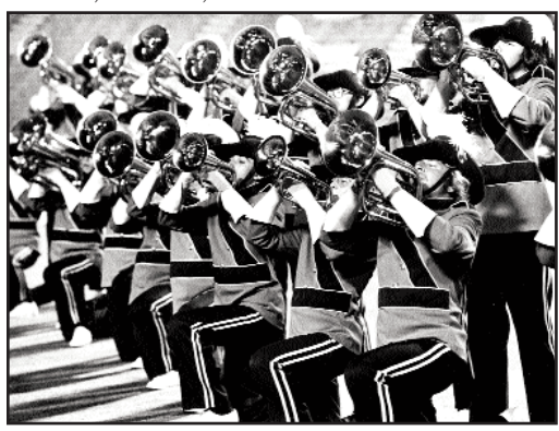
Santa Clara Vanguard, 1975, at DCI in Philadelphia, PA.

standstill on the steps of the Capitol, and to New York City for "cultural enrichment" before making the long bus trip home. On the home stretch, a breakdown resulted in the corps doing exhibitions in North Platte, NE, and Elko, NV.