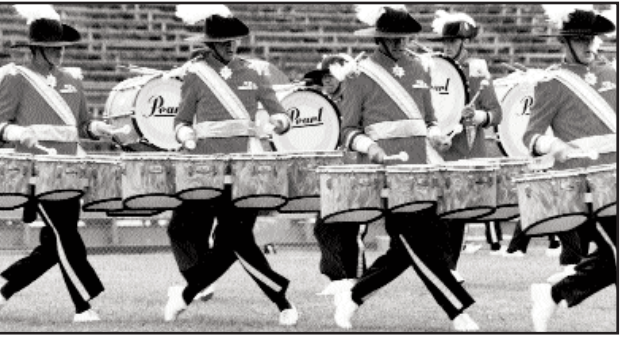
Santa Clara Vanguard, 1994.

In 1994, Vanguard returned to the storytelling style that brought them success throughout the late 1980s and early 1990s. Pulling music from a familiar Russian pallet, Vanguard wove a story of a love across