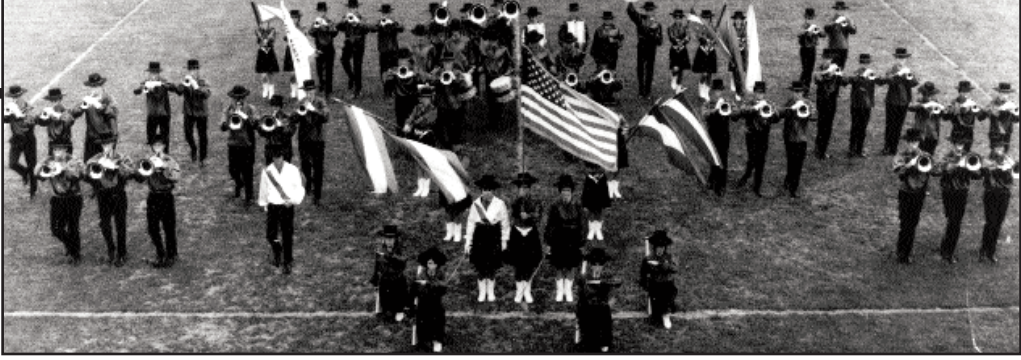
The 1967 Santa Clara Vanguard (photo from the collection of Drum Corps World).

The bell corps soon transformed into a bugle corps, but became a bit too much for the young lady who had, in the interim,