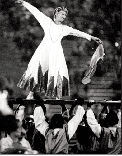
Santa Clara Vanguard, 1987, at the DCI Championships in Madison, WI.

Movement IV of "Symphony No. 3" by Giannini, On the Town, selections from "Appalachian Spring," Dream Sequence from "The Red Pony"